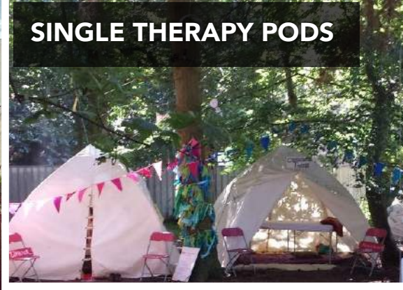
SINGLE THERAPY PODS