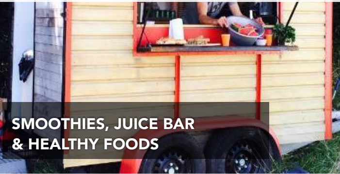
SMOOTHIES, JUICE BAR & HEALTHY FOODS

We also have our own smoothie, healthy drinks and snack bar "Whirled" and "Coconut Cabin" and can source other nourishing drinks and food caterers.