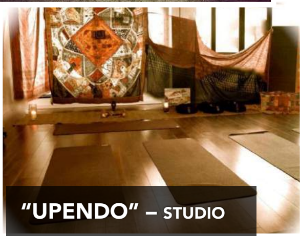
"UPENDO" – STUDIO